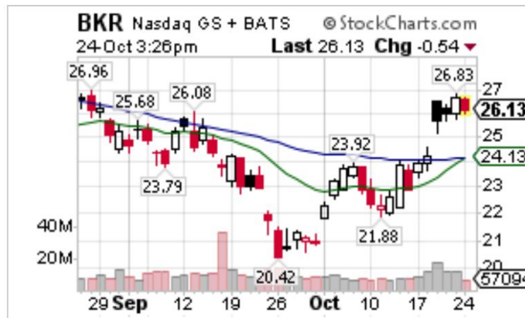
Chart of the Week – Holding Highlight