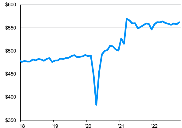
Real retail sales show consumer spending is still holding up Seasonally adjusted, billions of 2016 dollars*